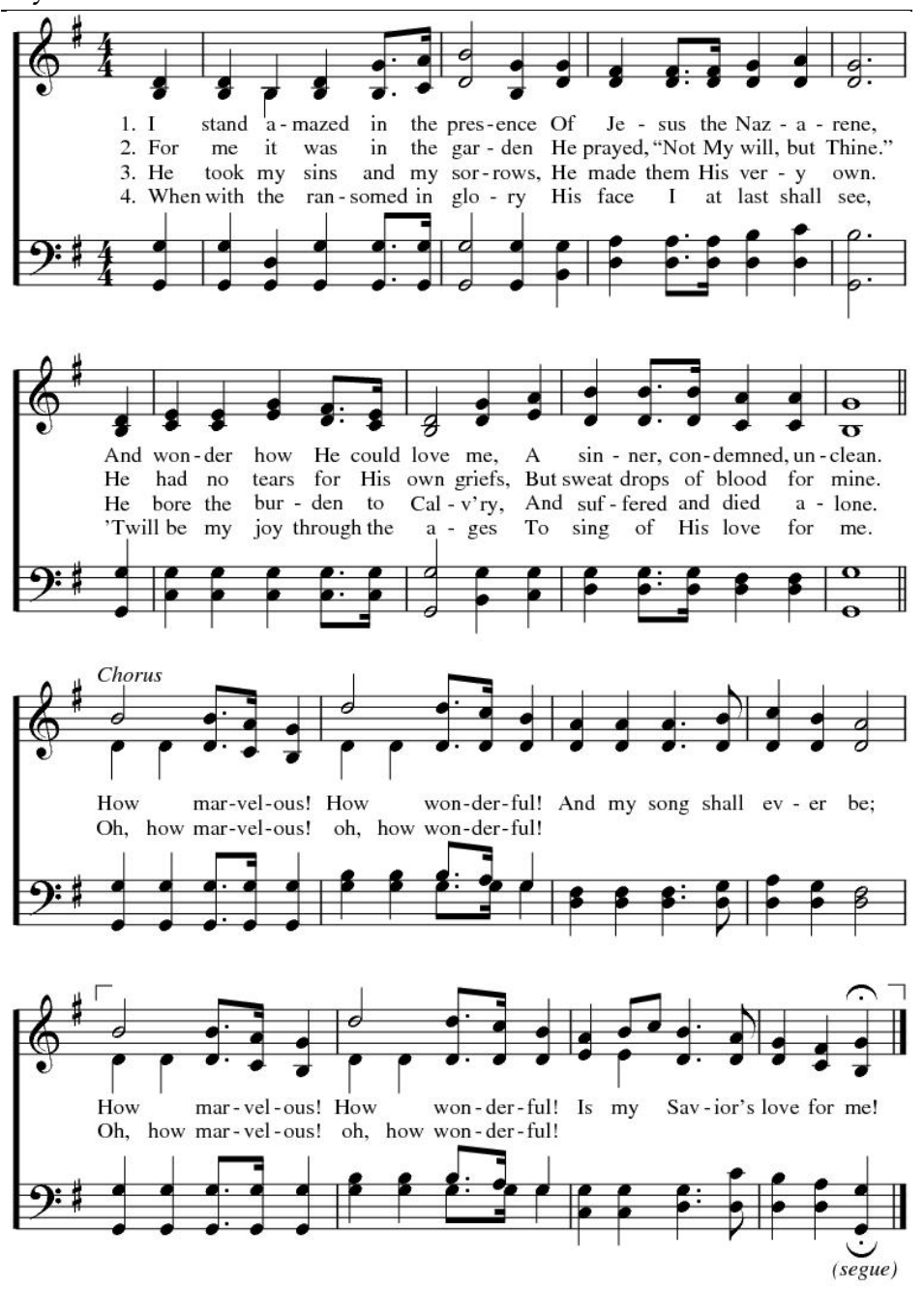
Words and Music by Charles H. Gabriel.