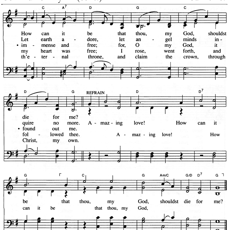
Words by Charles Wesley. Music by Thomas Campbell.