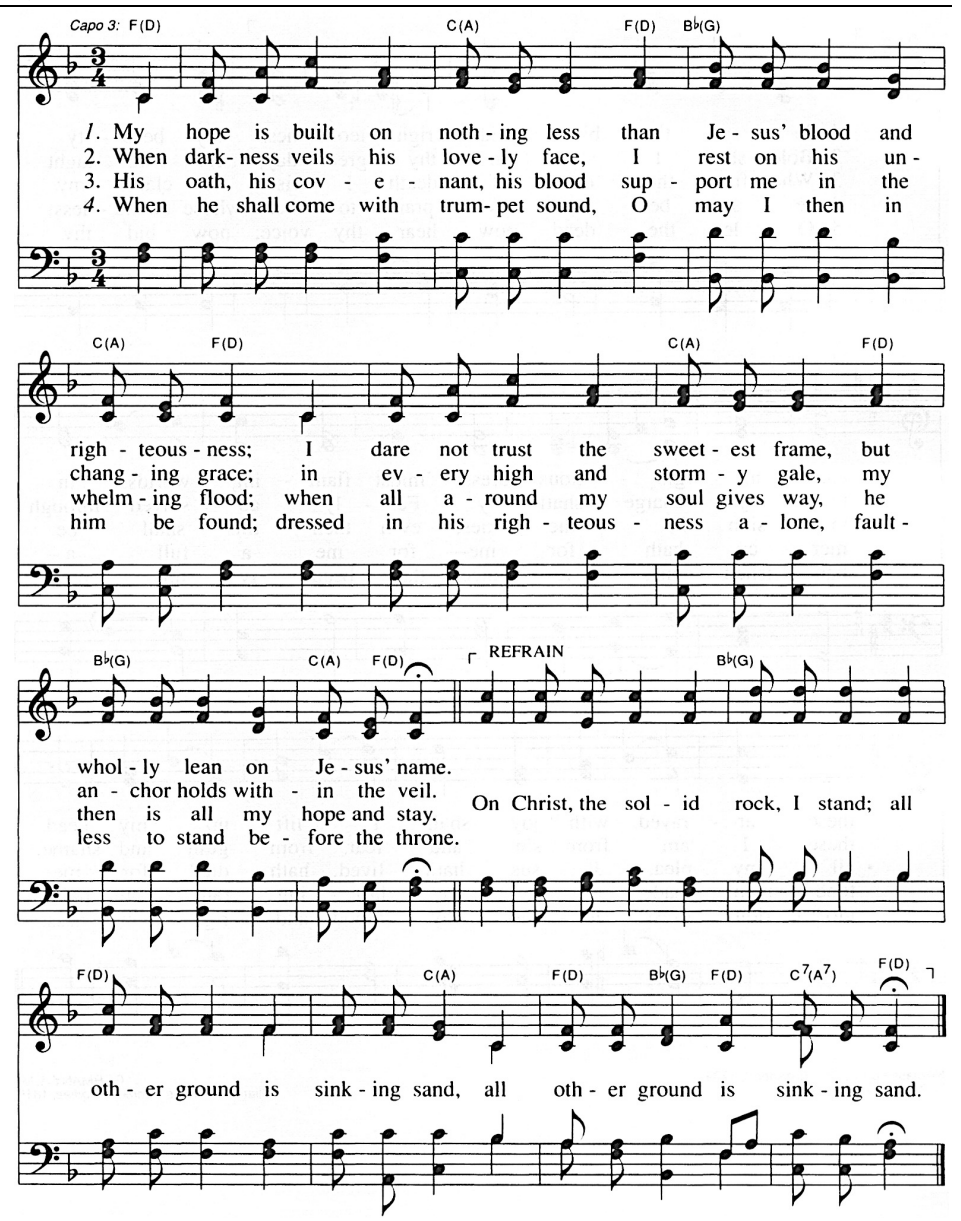
Words by Edward Motes. Music by William B. Bradbury