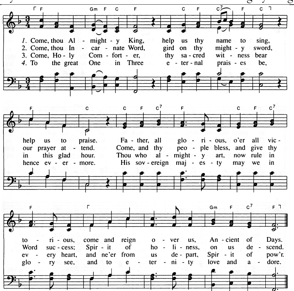
Words by Anonymous. Music by Felice de Giardini