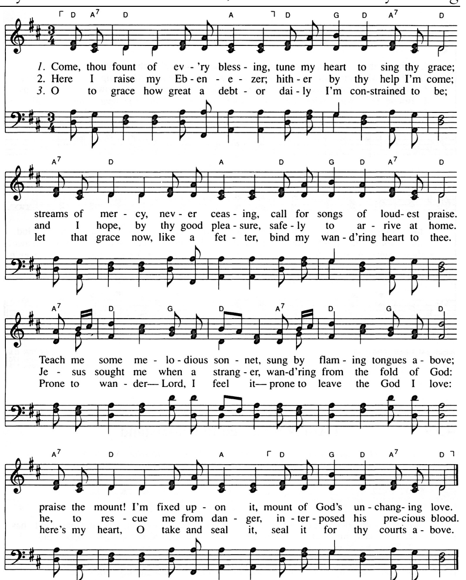
Words by Robert Robinson. Music by Asahel Nettleton.