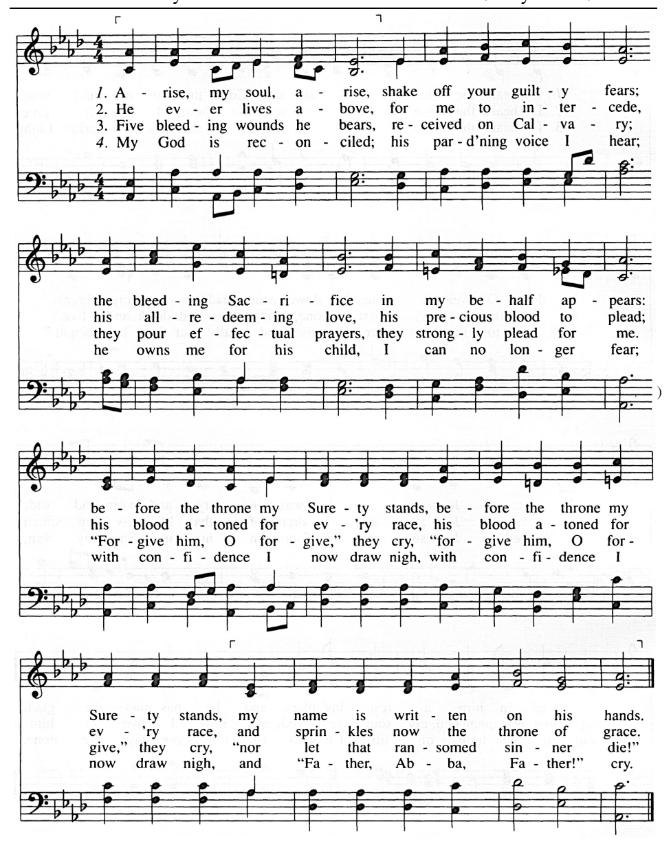
Words by Charles Wesley. Music by Louis Edson.