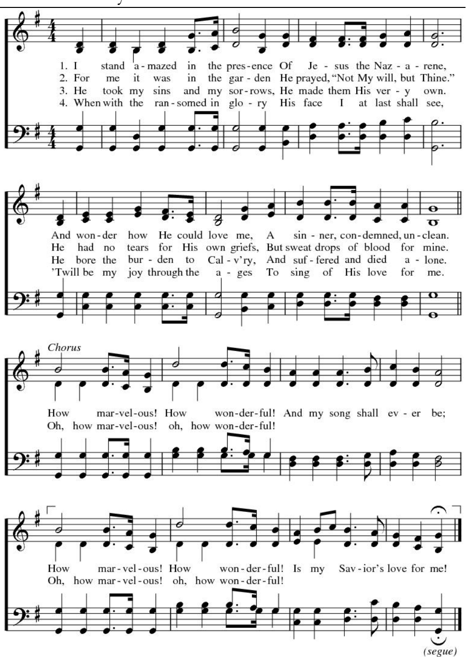
Words and Music by Charles H. Gabriel.