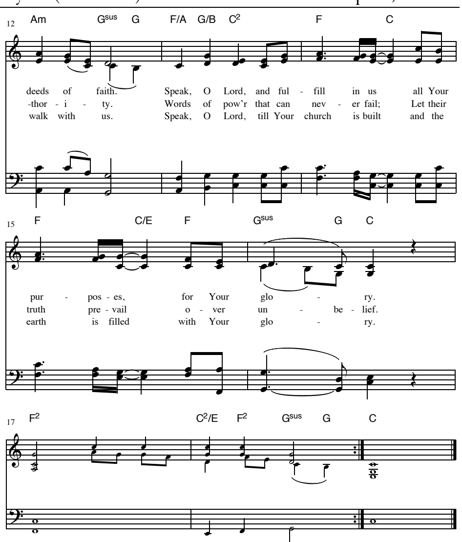
CCLI Song # 4615235 © 2005 Thankyou Music For use solely with the SongSelect. Terms of Use. All rights reserved. www.ccli.com CCLI License # 11233070