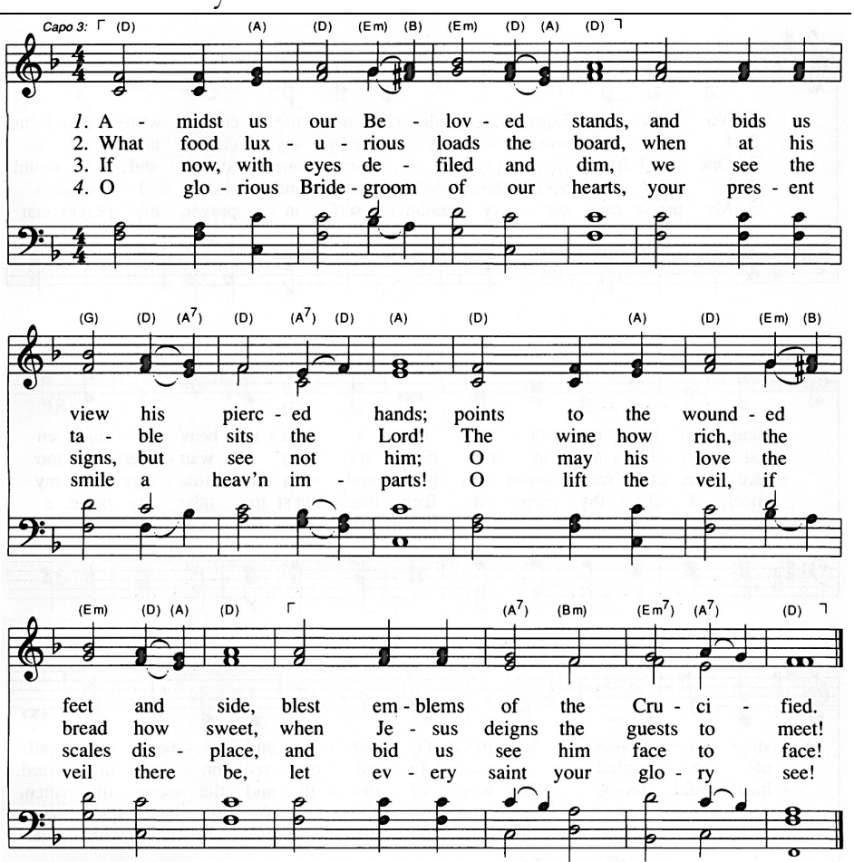
Words by C.H. Spurgeon. Music arr. by Lowell Mason.