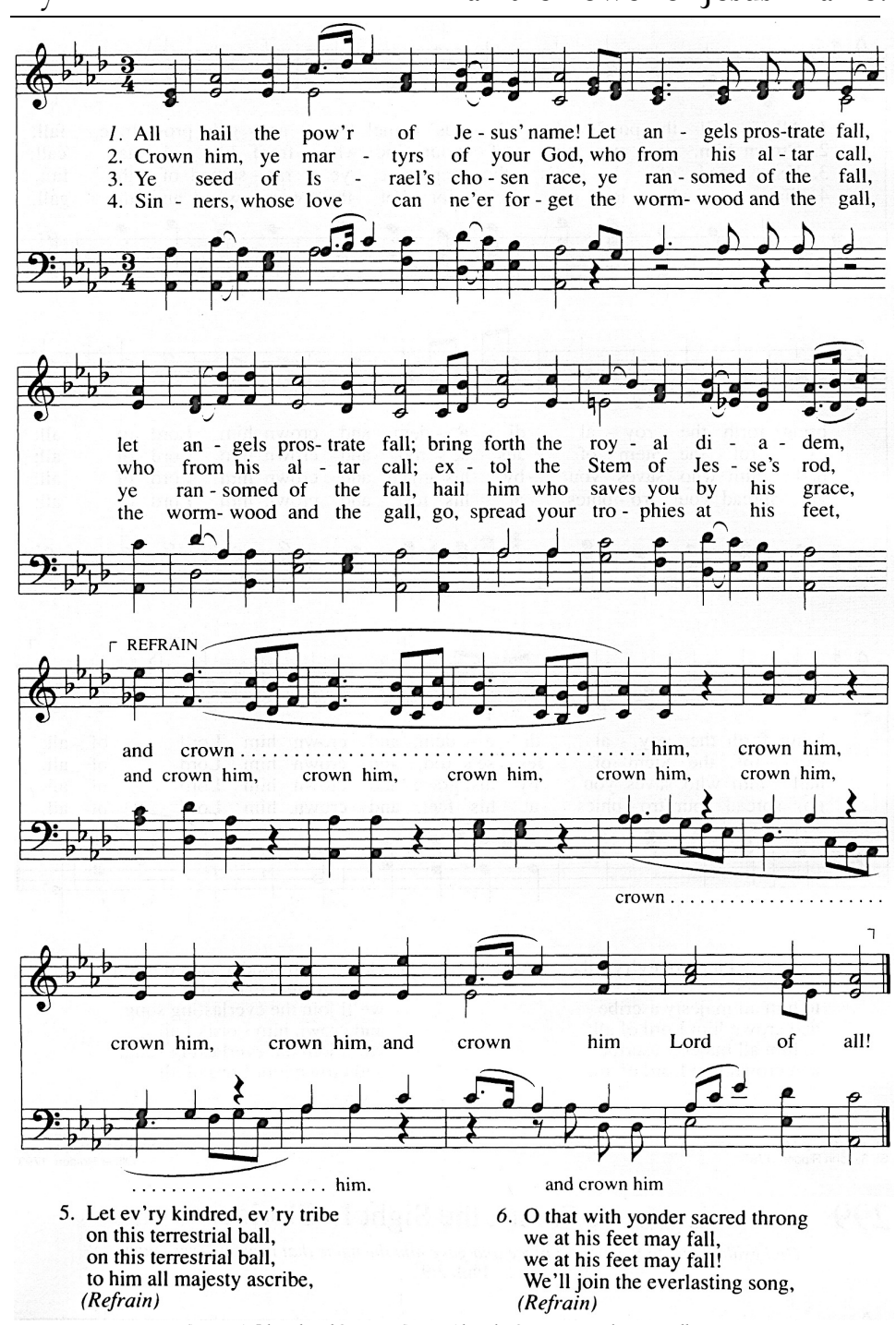
Stanzas 1-5 by Edward Perronet, Stanza 6 by John Rippon. Music by James Ellor.