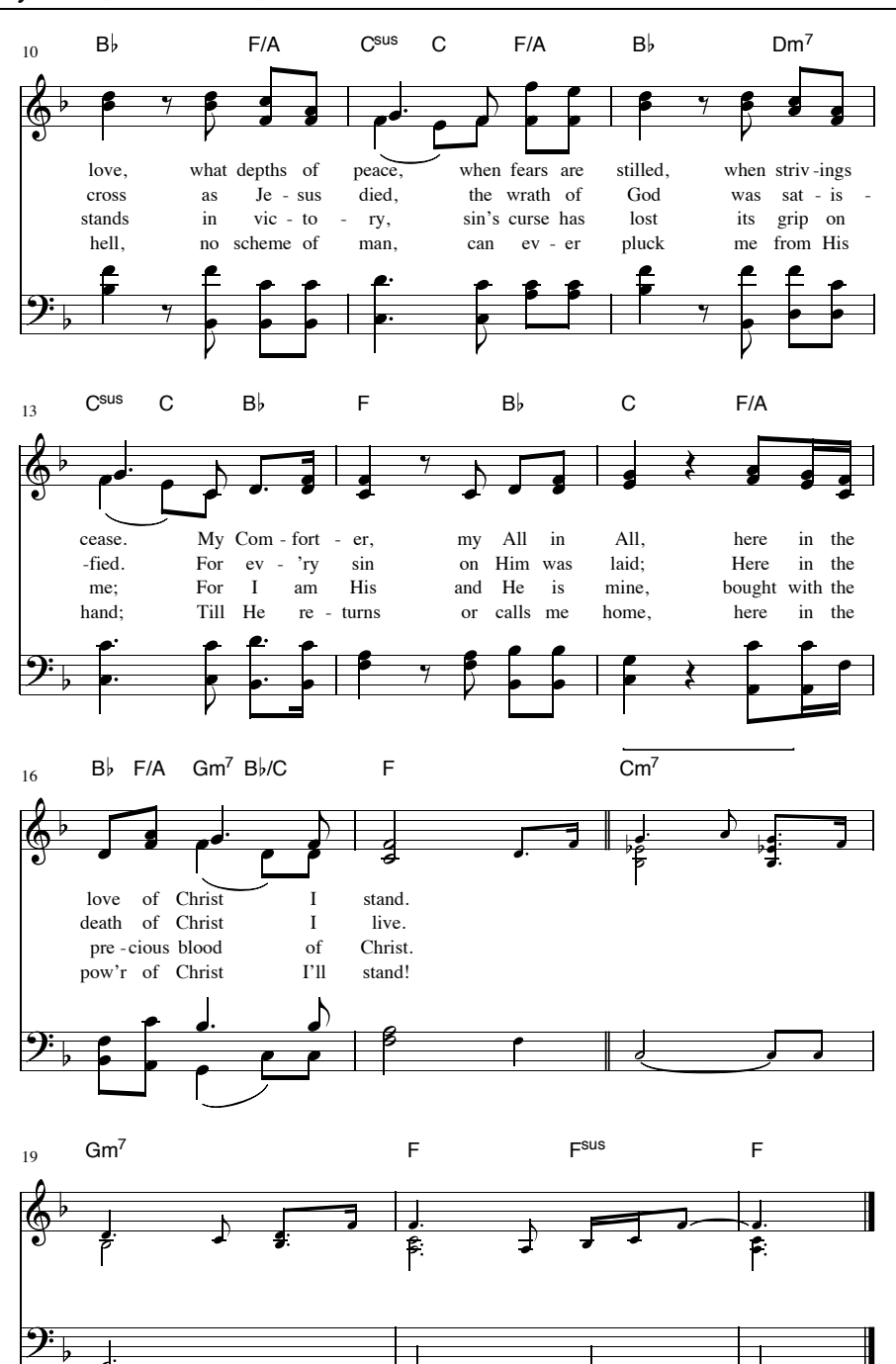
Words and Music by Keith Getty and Stuart Townend, Copyright © 2001 Thankyou Music