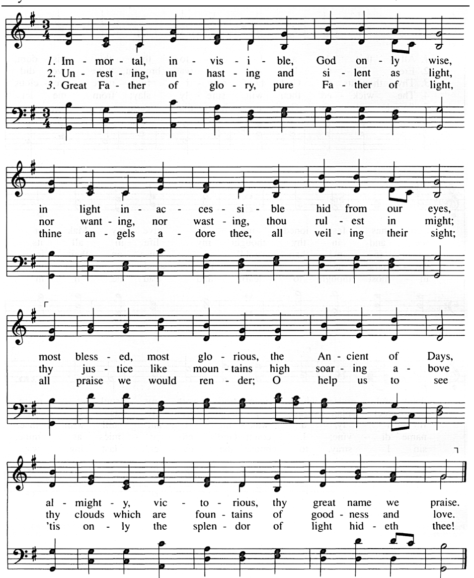
Words by Walter Chalmers Smith. Traditional Welsh hymn melody.