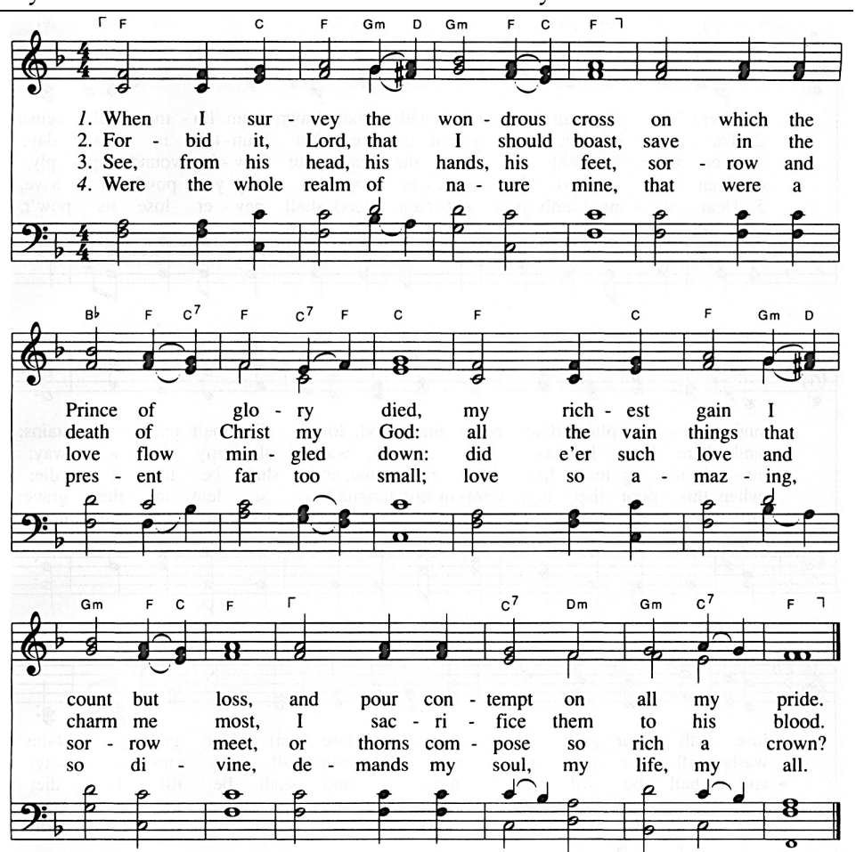
Words by Isaac Watts. Music arr. by Lowell Mason.