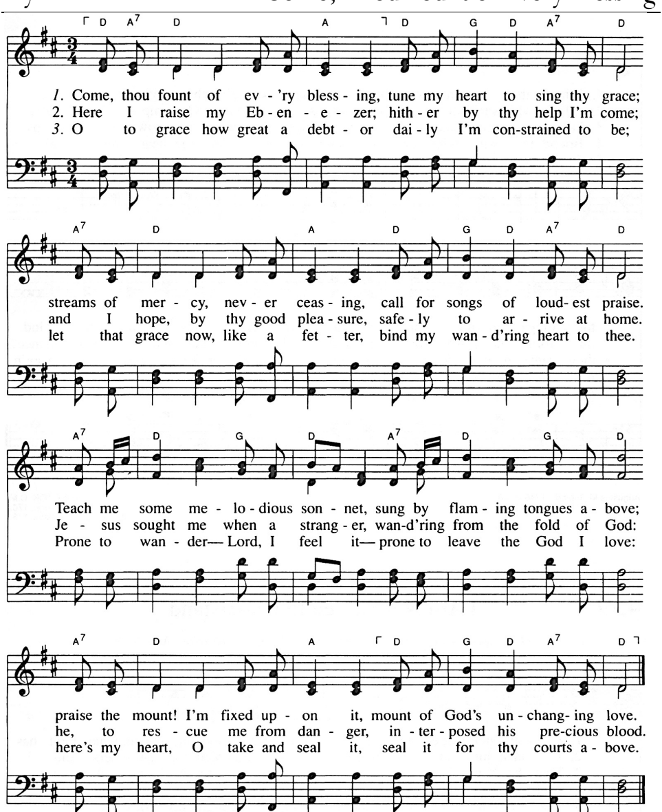
Words by Robert Robinson. Music by Asahel Nettleton.