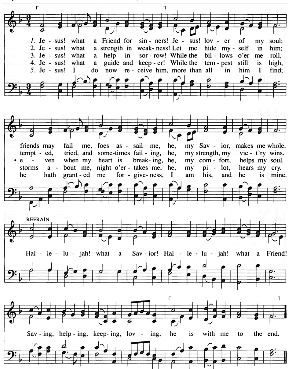
Words by J. Wilbur Chapman. Music by Rowland Hugh Pritchard.