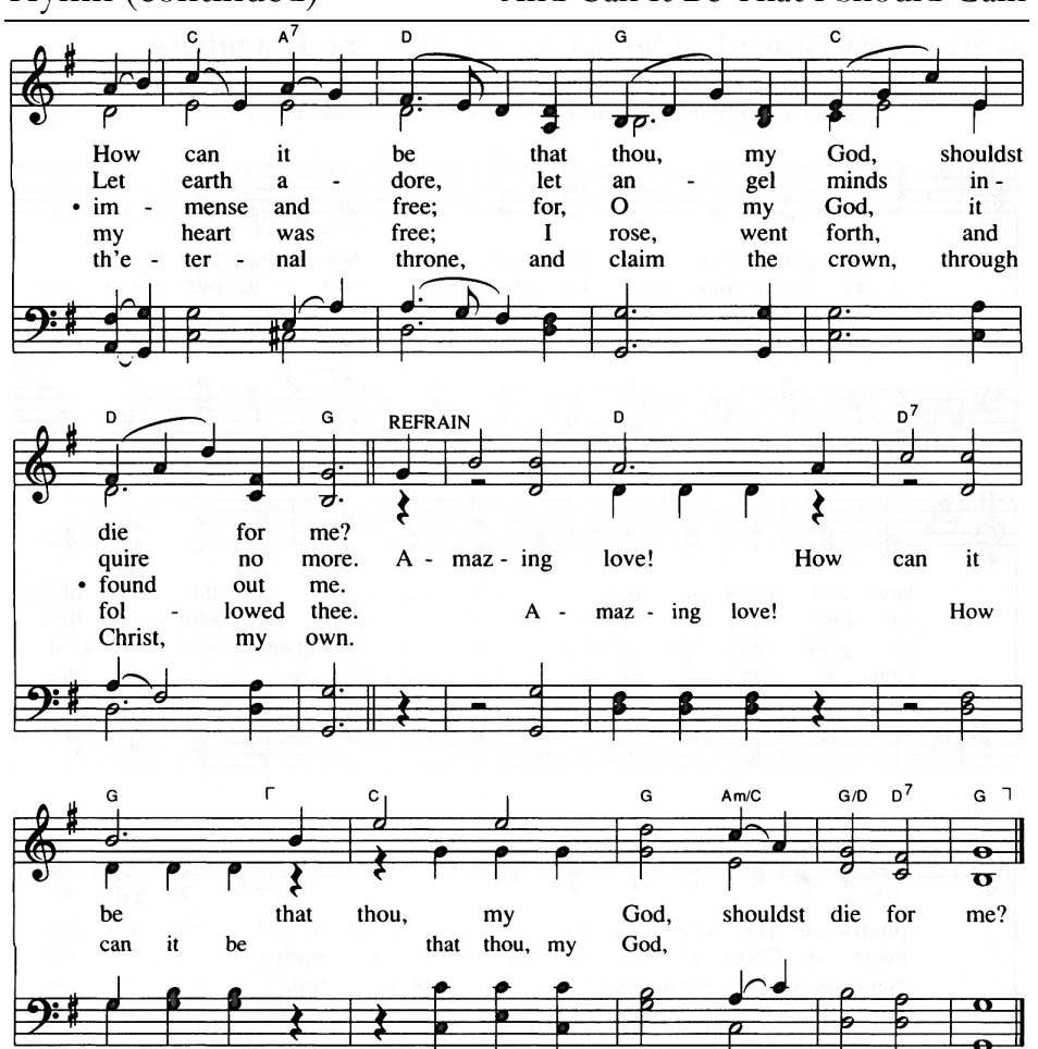
Words by Charles Wesley. Music by Thomas Campbell.